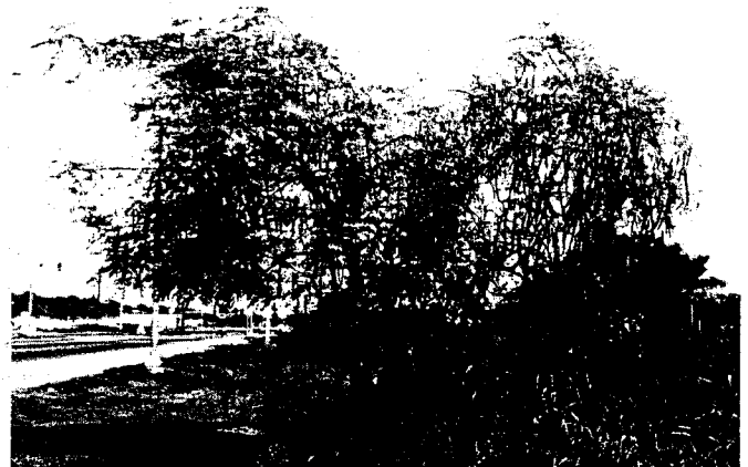
Figure 1: — Resedá ( Moringa oleifera ) in Puerto Rico.

In its native range, resedá grows in secondary dry tropical deciduous forests in association with Albizia procera (Roxb.) Benth., Bombax malabaricum DC., Dalbergia sissoo Roxb., Ficus glomerata Roxb., Gmelina arborea Linn., Kydia calycina Roxb., and Lagerstroemia parviflora Roxb. (2, 9). In secondary forests on the south coastal plain of Puerto Rico, resedá is associated with A. lebbek (L.) Benth., Bucida buceras L., Leucaena leucocephala (Lam.) de Wit, Pithecellobium dulce (Roxb.) Benth., Prosopis pallida (H. & B.) ex Willd., Tabebuia heterophylla (DC.) Britton, and Tamarindus indica L. (author, personal observation).