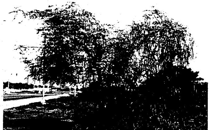
Figure 1: — Resedá ( Moringa oleifera ) in Puerto Rico.

In its native range, resedá grows in secondary dry tropical deciduous forests in association with Albizia procera (Roxb.) Benth., Bombax malabaricum DC., Dalbergia sissoo Roxb., Ficus glomerata Roxb., Gmelina arborea Linn., Kydia calycina Roxb., and Lagerstroemia parviflora Roxb. (2, 9). In secondary forests on the south coastal plain of Puerto Rico, resedá is associated with A. lebbek (L.) Benth., Bucida buceras L., Leucaena leucocephala (Lam.) de Wit, Pithecellobium dulce (Roxb.) Benth., Prosopis pallida (H. & B.) ex Willd., Tabebuia heterophylla (DC.) Britton, and Tamarindus indica L. (author, personal observation).